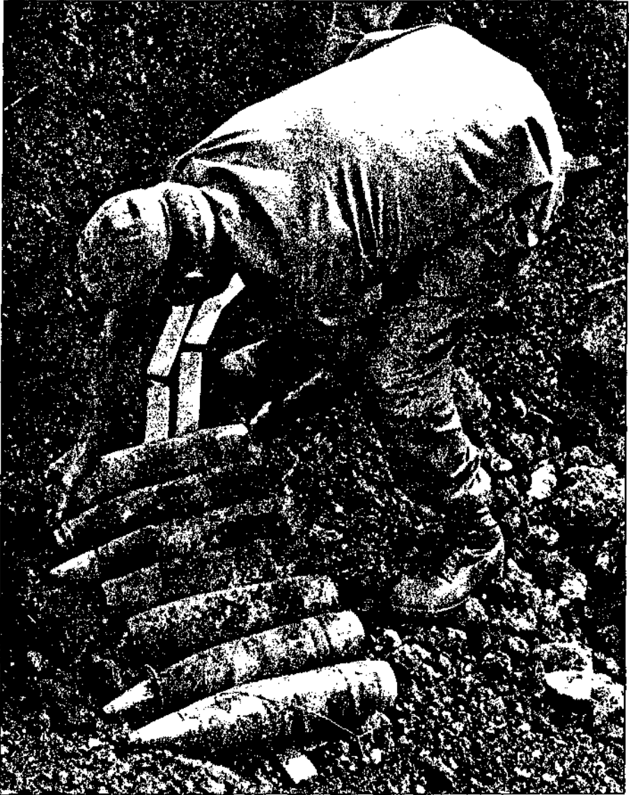
FIGURE 93.—Rounds of 106 mm white phosphorus are placed on top of C-4 explosive at an ammunition dump.

United States because of its availability on many military installations, although rigid control of its use makes this unlikely.