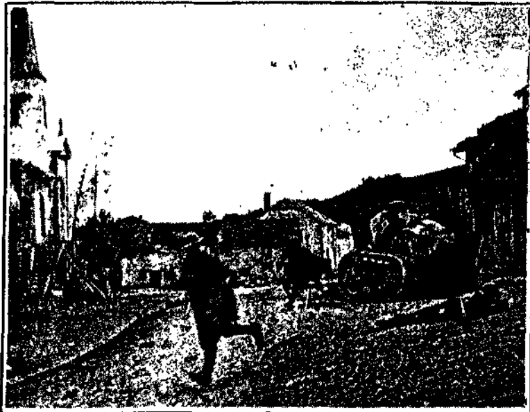
Men of the 18th Infantry, 1st Division, seek cover from German shelling at Evermont Ardennes, France, on October 7, 1918.